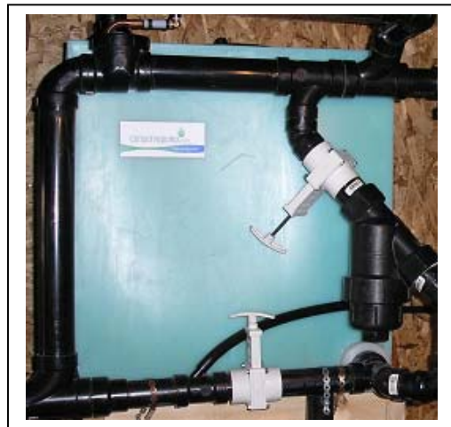
Typical home water reuse system storage tank and plumbing.