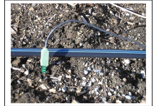
The included soil moisture sensor is the key to it's smart operation

Your Smartbox lets you create the most sophisticated rain-watering system possible. Just hook it up to your existing rain barrel and irrigation.